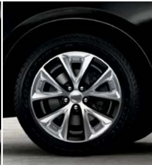
20-inch polished aluminum with Gloss Black pockets (optional on R/T)