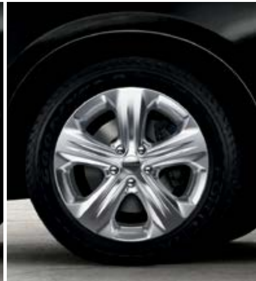
20-inch polished aluminum (optional on Limited)