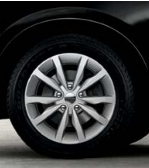
18-inch Tech Silver aluminum (standard on SXT)