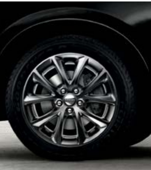
20-inch Hyper Black aluminum (standard on Rallye and R/T)