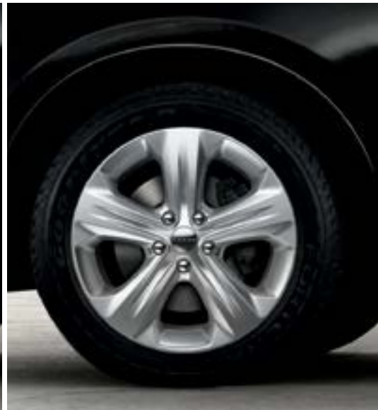
20-inch Satin Silver aluminum (optional on SXT; late availability)