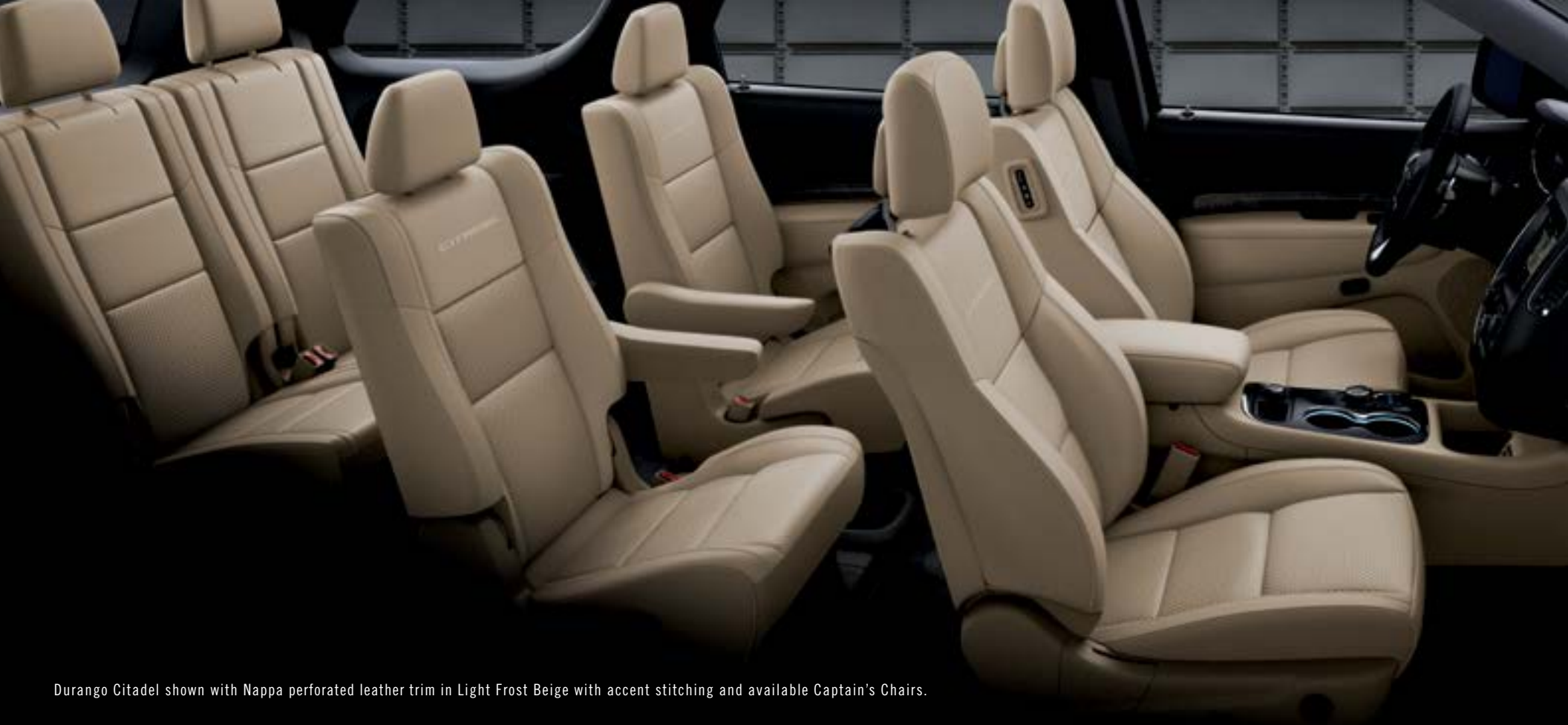
Durango Citadel shown with Nappa perforated leather trim in Light Frost Beige with accent stitching and available Captain's Chairs.