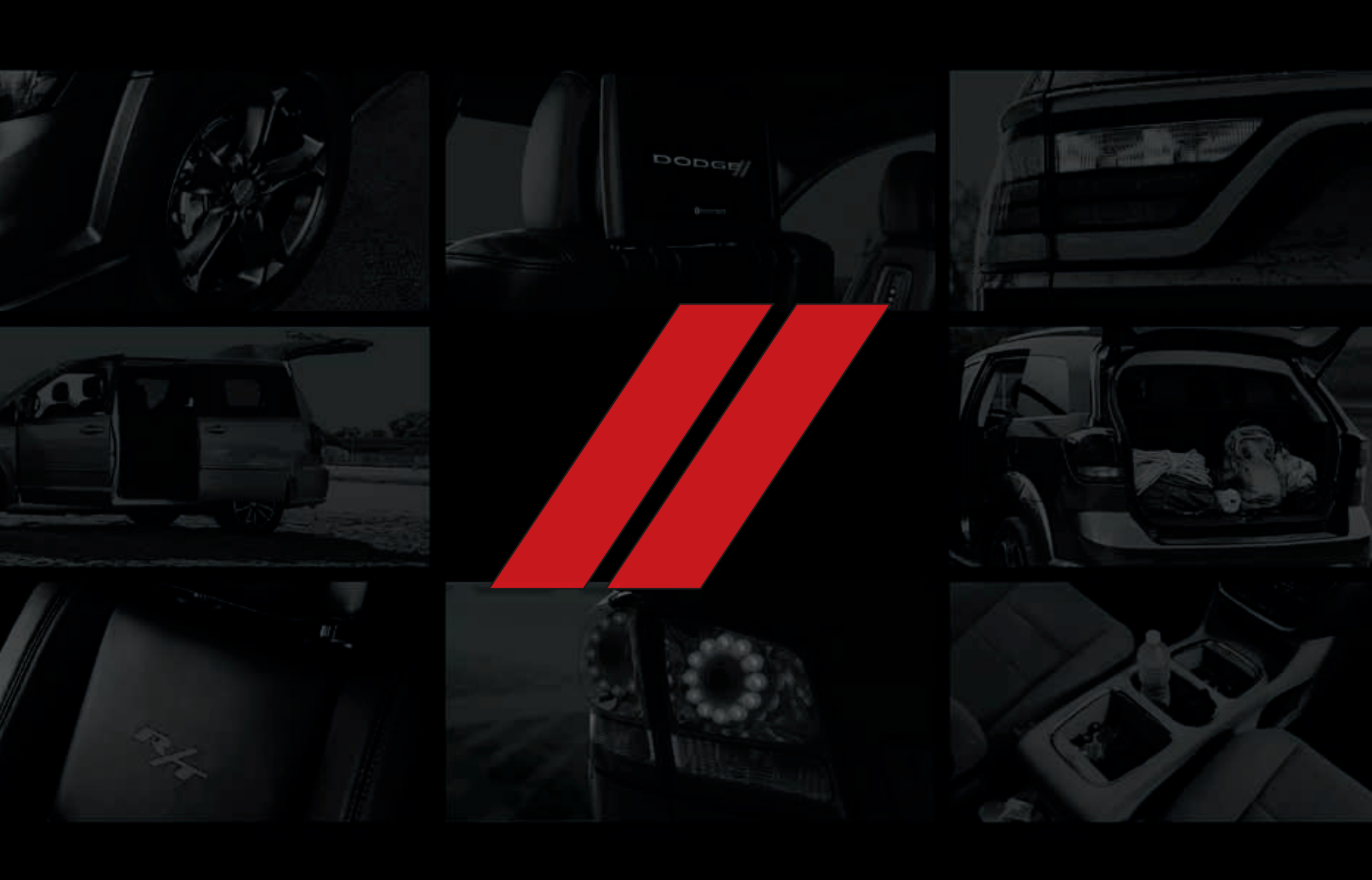
2016 DODGE JOURNEY