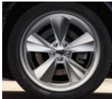
20-inch Heritage II polished forged aluminum (optional on R/T Classic)