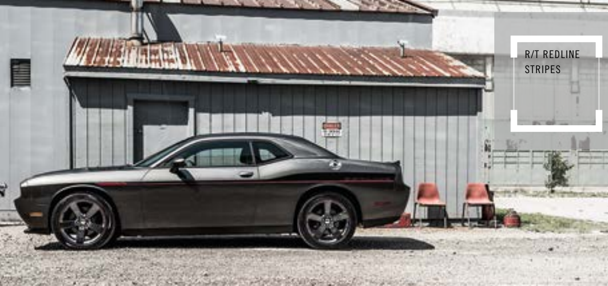
R/T REDLINE STRIPES