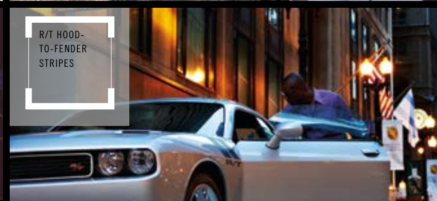
R/T HOOD-TO-FENDER STRIPES