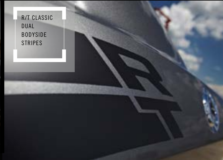
R/T CLASSIC DUAL BODYSIDE STRIPES