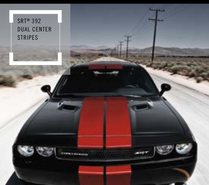
SRT® 392 DUAL CENTER STRIPES