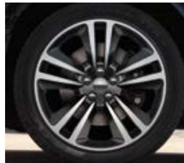
20-inch cast aluminum with Black pockets (standard on SRT® Core)