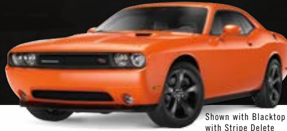
Shown with Blacktop Package with Stripe Delete