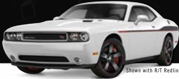
Shown with R/T Redline Group