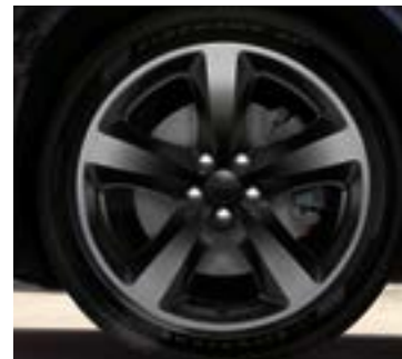
20-inch Gloss Black aluminum (included in Sinister Super Sport Group on SXT, SXT Plus and in Blacktop Package on R/T and R/T Plus)