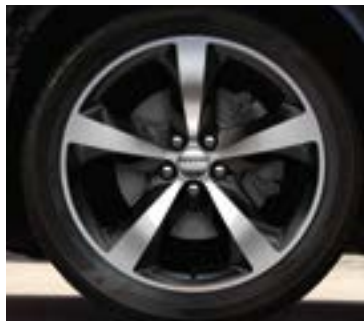
20-inch polished aluminum with Gloss Black pockets (standard on R/T Classic)