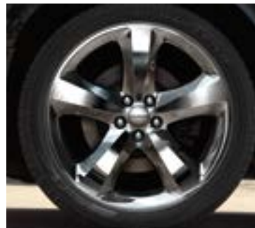
20-inch chrome-clad aluminum (included in Super Sport Group on SXT and SXT Plus and optional on R/T and R/T Plus)