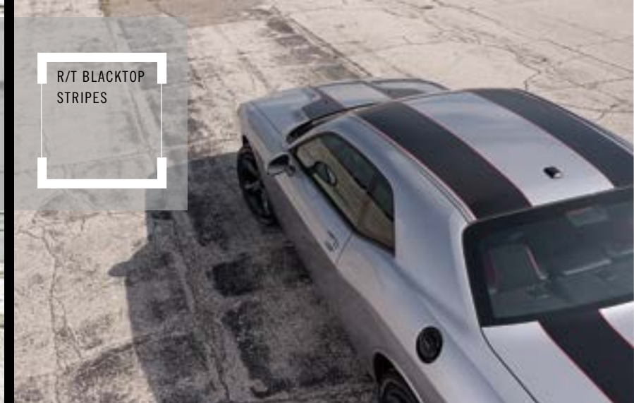
R/T BLACKTOP STRIPES