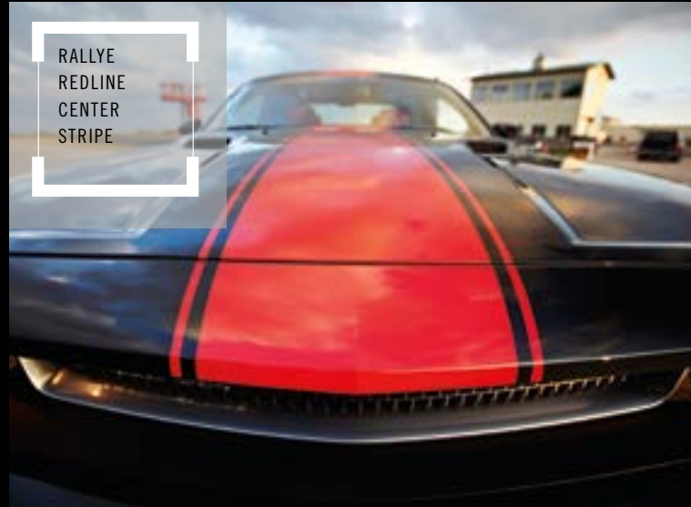
RALLYE REDLINE CENTER STRIPE