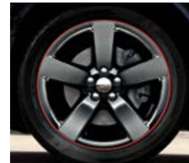
20-inch Black Chrome aluminum with Red lip/backbone (standard on Rallye Redline and included in R/T Redline Group on R/T and R/T Plus)