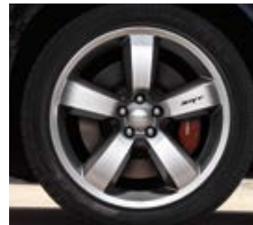
20-inch polished forged aluminum with Black pockets (standard on SRT 392)