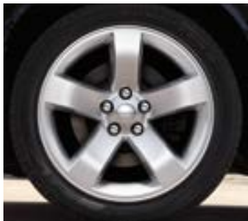
18-inch aluminum (standard on SXT, SXT Plus, R/T and R/T Plus)