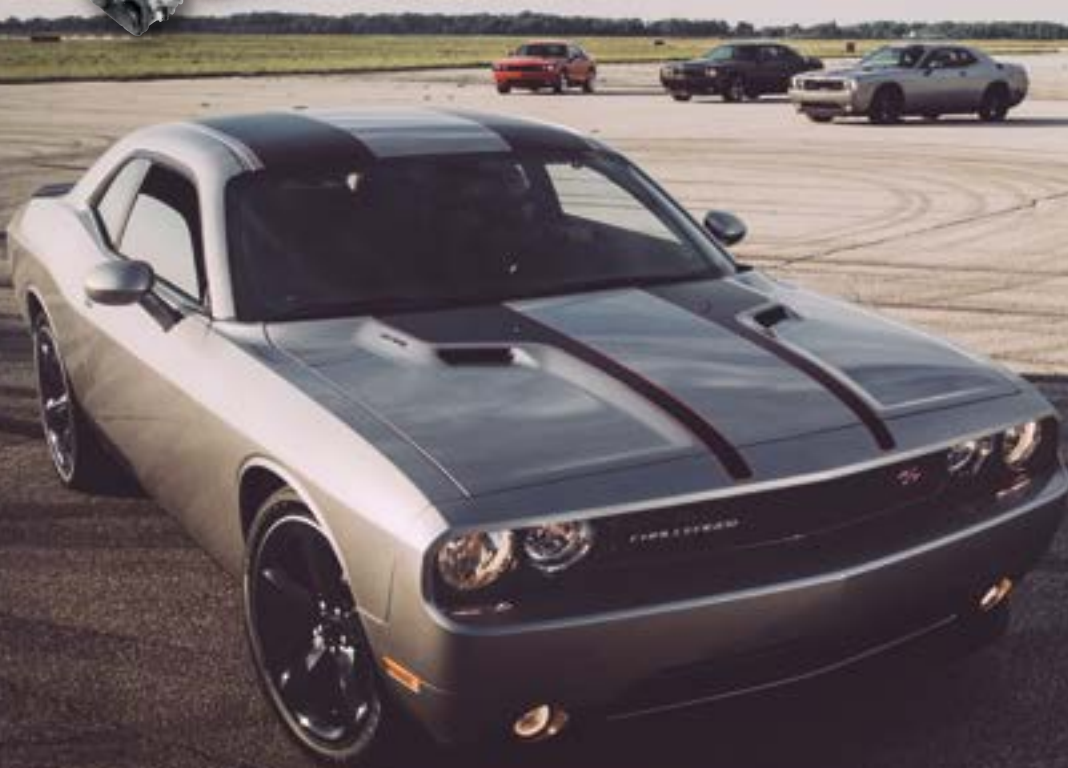
Challenger R/T Blacktop shown in Billet Silver Metallic with Blacktop stripes.

392-CU-IN SRT® HEMI V8 WITH 470 LB-FT OF TORQUE