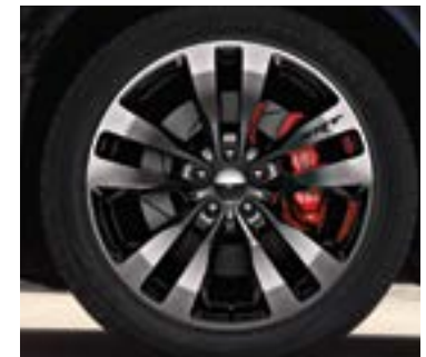
20-inch Black Vapor Chrome aluminum (optional on SRT Core and SRT 392)