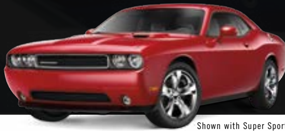
Shown with Super Sport Group